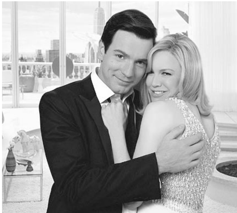
Scene from the movie "Down with Love"

The event is free and open to the public. ❖