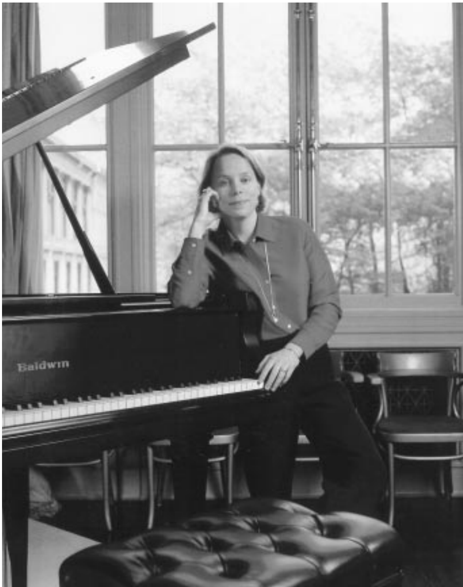
Augusta Read Thomas

Thomas is a recipient of numerous grants, fellowships and awards, including the International Orpheus Prize for her chamber-opera Ligeia , a Grammy for Love Songs and The Rub of Love , and the Third Century Award from the Office of Copyrights and Patents in Washington, DC. She is an Associate of the Royal Academy of Music.