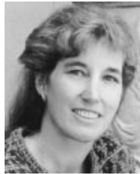
Sarah Blaffer Hrdy

Ran has received honorary doctorates from Mount Holyoke College, Spertus Institute, Beloit College and the New School of Social Research in New York. In 1992, she was elected a Fellow of the American Academy of Arts and Sciences.