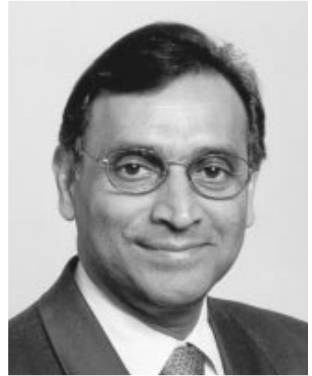
Honorable Jayantha Dhanapala