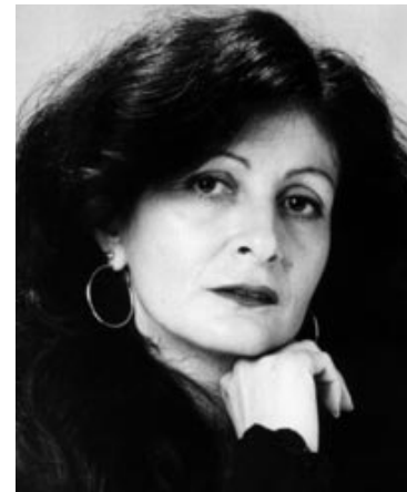
Judith Ortiz Cofer