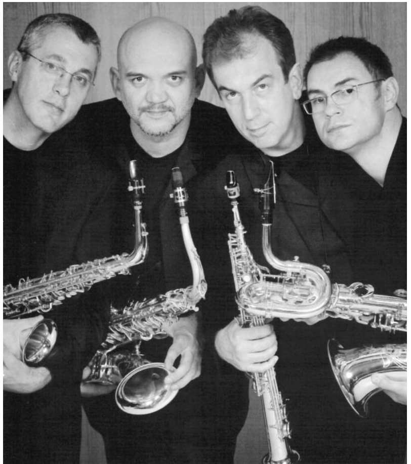
Zagreb Saxophone Quartet