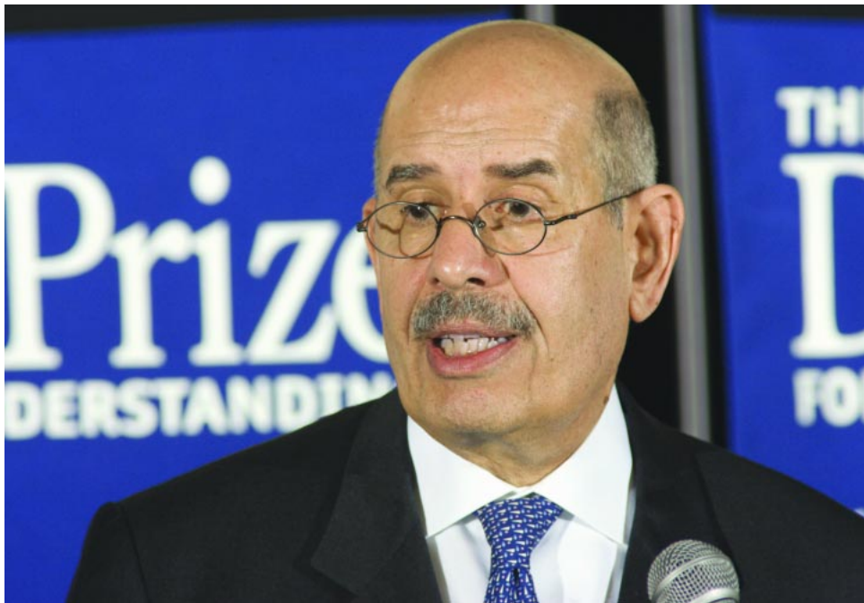
Dr. Mohamed ElBaradei

Dr. ElBaradei considers the IAEA's function of weapons inspection to be "an early warning system" for