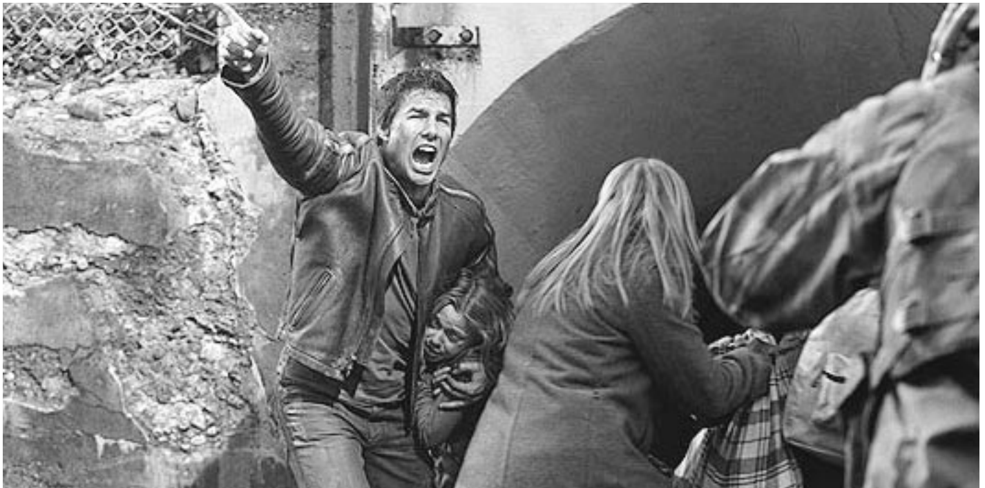
Scene from the movie “War of the Worlds”

Telotte is author of A Distant Technology: Science Fiction Film and the Machine Age (1999) and Replications: A Robotic History of the Science Fiction Film (1995).