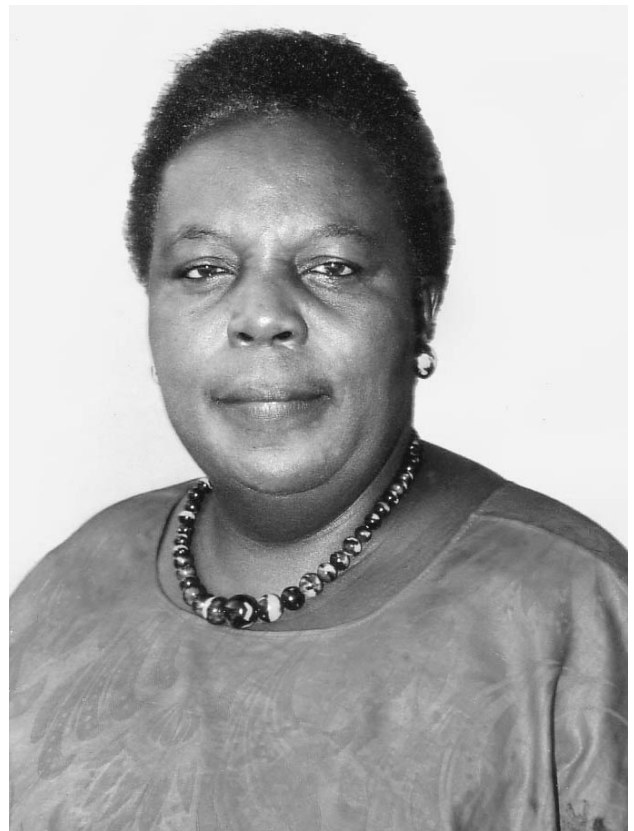
Gertrude I. Mongella