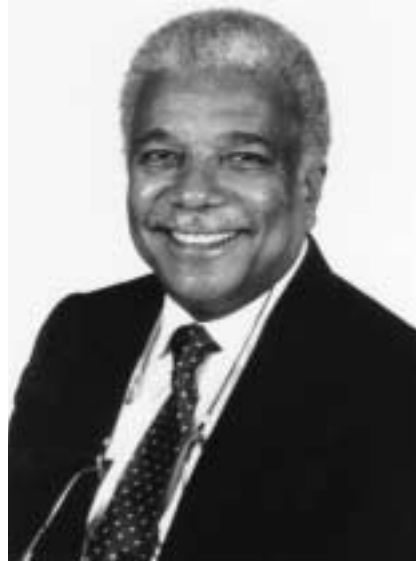
Ali M. Mazrui

Mazrui is also the author and narrator of the nine-part public television documentary The Africans: A Triple Heritage , aired around the world